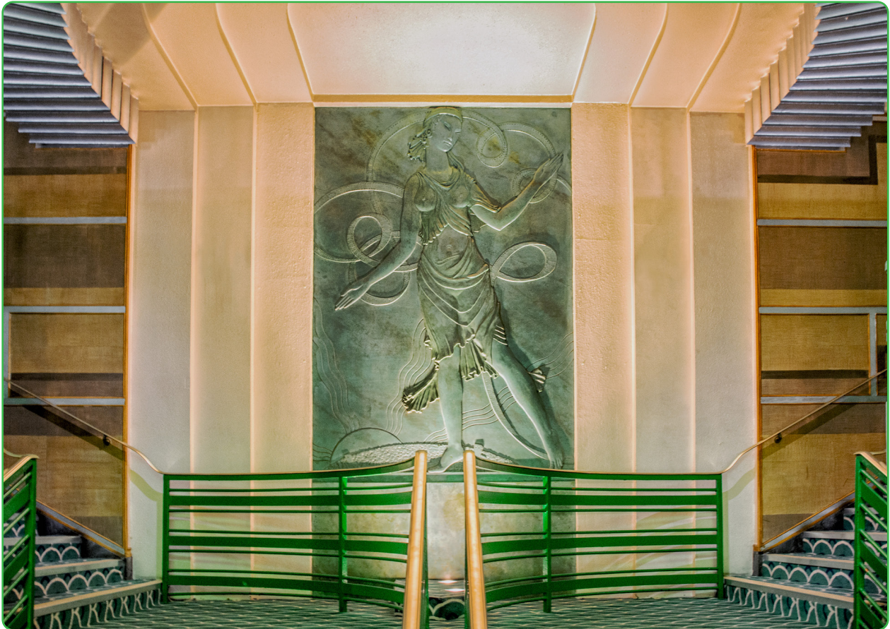
Photograph of 'The Spirit of Film' in the theatre foyer.